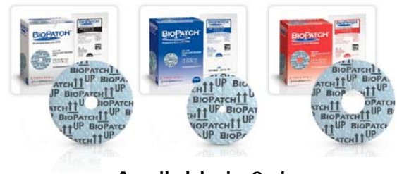
Available in 3 sizes